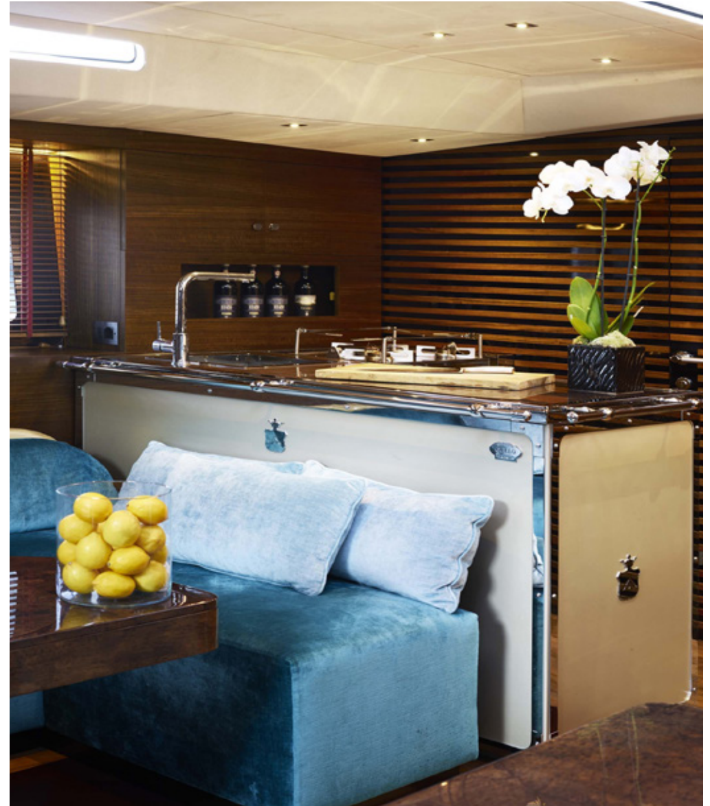
TUSCAN SPIRIT - HANSE YACHT