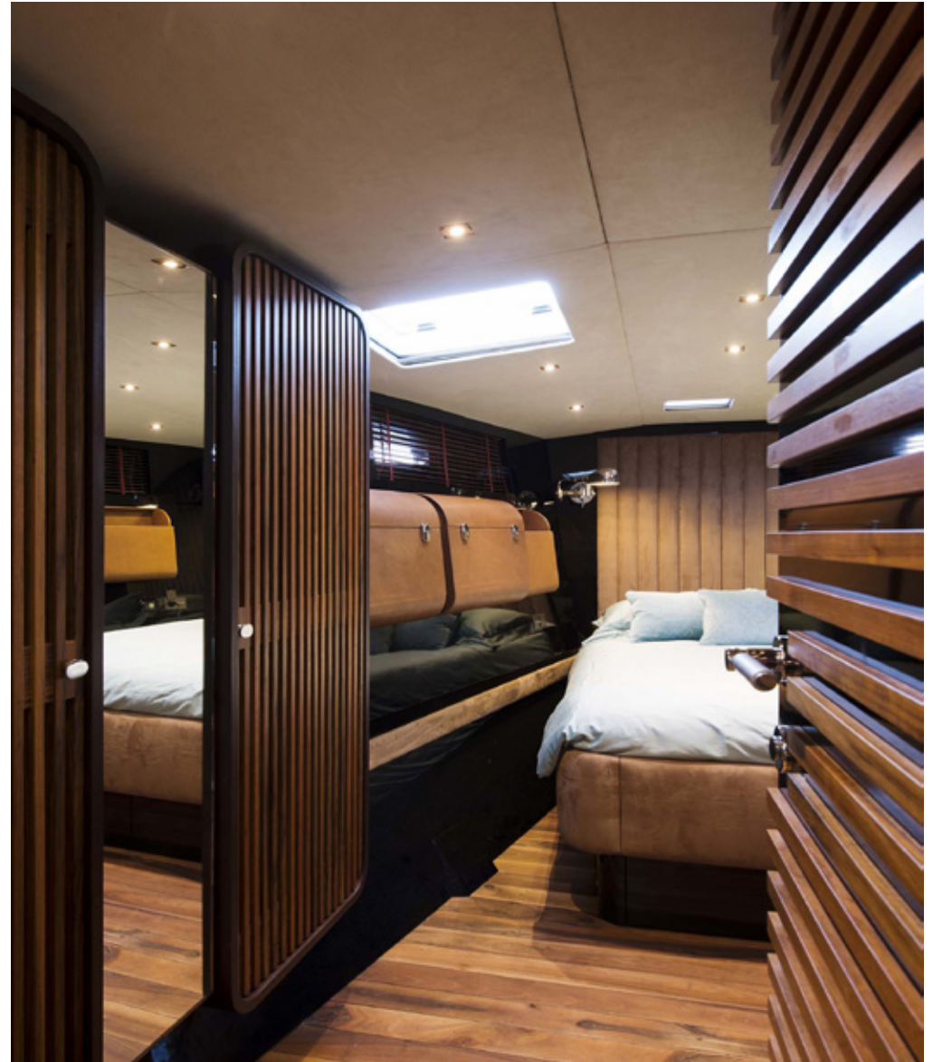
TUSCAN SPIRIT - HANSE YACHT