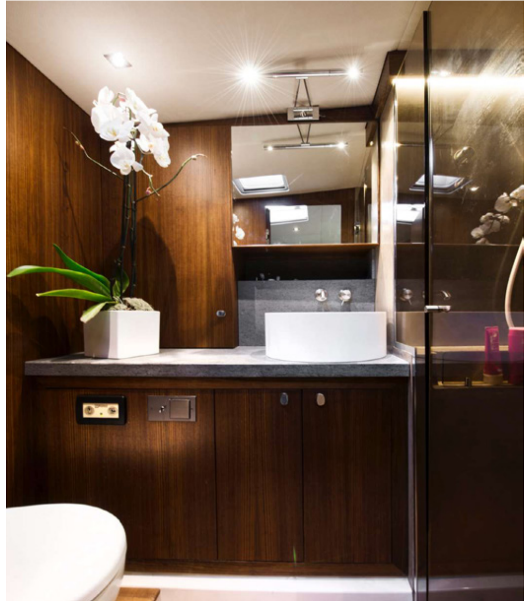
TUSCAN SPIRIT - HANSE YACHT