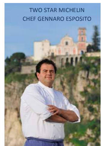
TWO STAR MICHELIN CHEF GENNARO ESPOSITO

Trip minimum 3 nights: Embarking/disembarking in Pozzuoli (Naples) price from €12.000 + Vat + Expenses Maximum 6 Guests / Private Charter Only