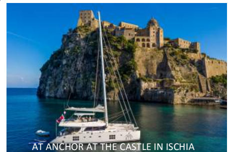
AT ANCHOR AT THE CASTLE IN ISCHIA