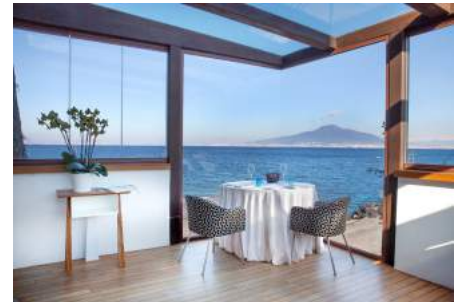
VIEW FROM LA TORRE DEL SARACINO

Dock below the cliffs of Amalfi Hike up the 1500 stairs (or down!) to XI Century Villa in Ravello Enjoy a concert at Ravello the music festival St Andrew's Cathedral, lemons, limoncello & quaint seaside restaurants